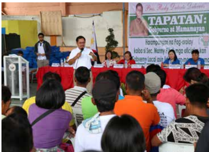
Agriculture secretary Emmanuel F. Piñol (above) assures the more than 900 farmers (photo below) affected by the eruption of Mayon Volcano that the DA has enough fund for them.