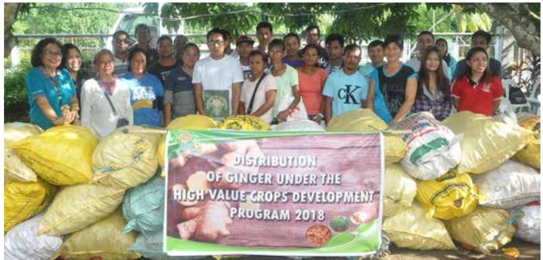
Farmers from Camarines Sur who will venture on ginger production.