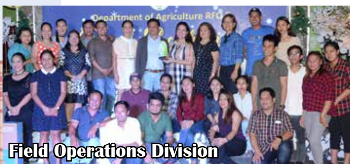
Field Operations Division