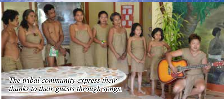
The tribal community express their thanks to their guests through songs.

The Agta-Tabangnon tribe in Coyao-yao, Tigaon Camarines Sur is a community of indigenous people who had abandoned their former nomadic way of life and have now opted to settle in a permanent location and are now slowly embracing the modern way of life, new farming techniques and welcoming new livelihood opportunities.