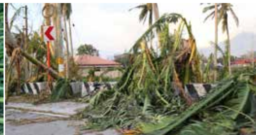
Truckloads of _____

For high value crops which include, vegetables and fruit crops over 6,596 hectares were damaged valued at over P 697 million. Of these 5,520.13.86 hectares are totally damaged and 1,076 hectares are partially damaged. For organic agriculture an estimated production loss valued at P3.8million was reported by the provinces of Albay, Catanduanes and Masbate. For the fisheries an estimated production loss valued at over P25 million were also reported in Albay and Sorsogon. For coconut an estimated production loss valued over