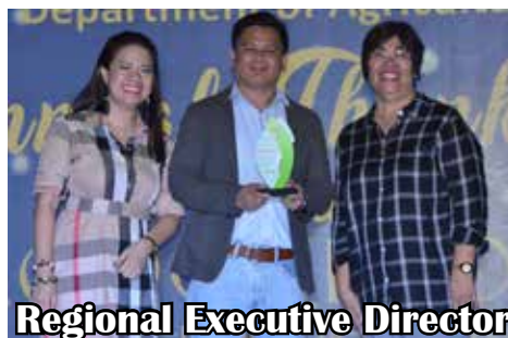
Regional Executive Director

Best Organizational Units Awards were given to Administrative & Finance Division; Agribusiness and Marketing Assistance Division (AMAD); Field Operations Division (FOD); Integrated Laboratories Division (ILD); Planning, Monitoring & Evaluation Division (PMED); Regional Agricultural Engineering Division (RAED); Regional Agriculture and Fisheries Information Section (RAFIS); Regulatory Division; and Research Division.