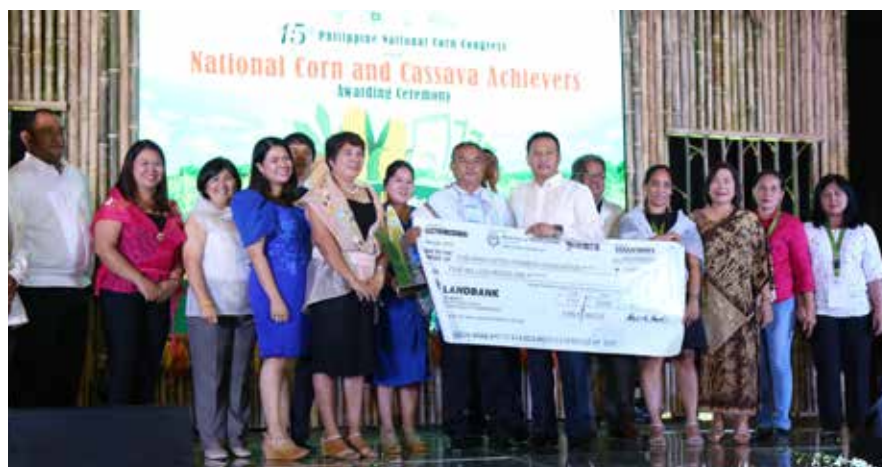
The Tuburan United Farmers Association of Cawayan, Masbate won P5 million as Champion of the 2019 Cassava Cluster Management Excellence Awards.

participants from different regions to promote rice-corn blend as well as organize model cluster areas for corn. He also emphasized the value of sharing to Extension Workers. "The real test is not only in school but what you learn, you acquire then you apply and eventually, you teach" he said. "The important parameter is, you should bear fruit, you multiply yourself in so many and we will be all builders of