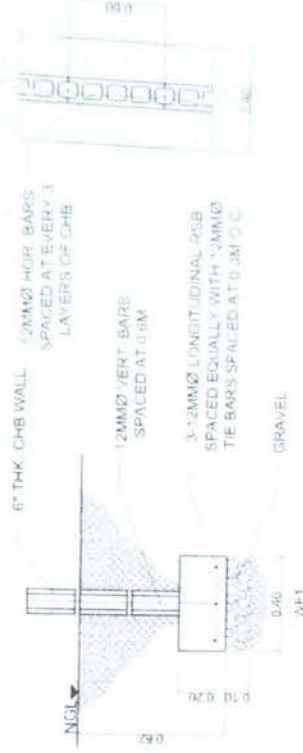
2 WALL FOOTING DETAIL SCALE 1:20